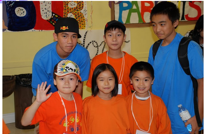
Children from our Vietnamese and our Hispanic summer programs