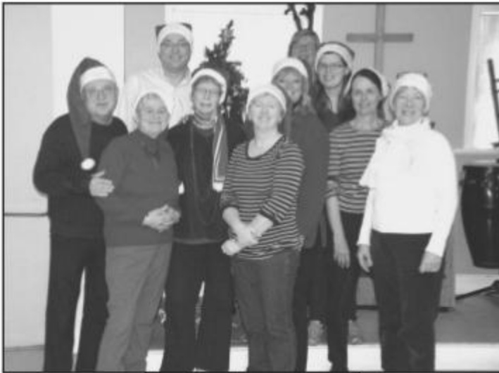
Food Bank Volunteers