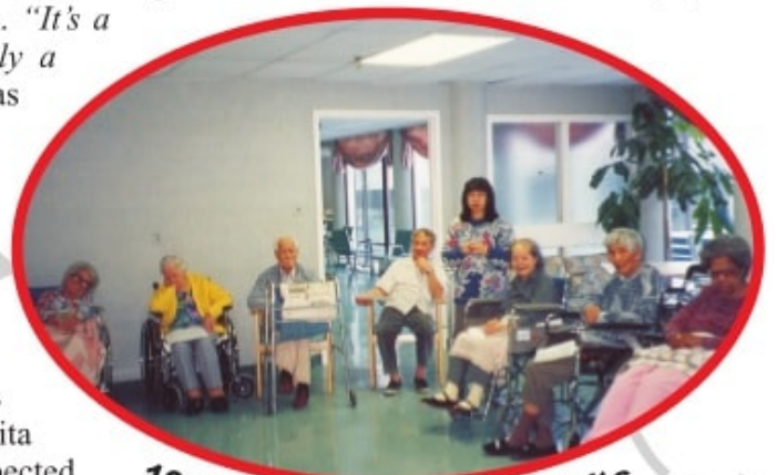
1989 - Nursing Home Visits