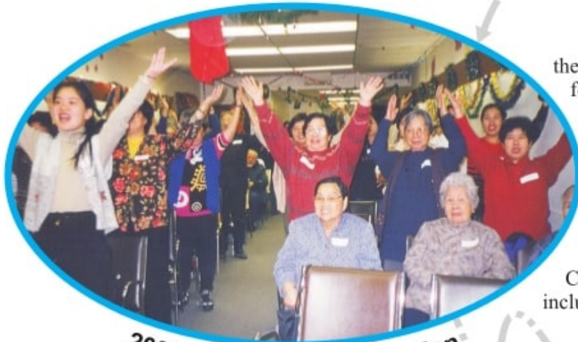
2000 - Christmas Celebration

the year. The ESL program provided a platform for The Lighthouse's clients to build a community of support they had a shared language, background, and culture that enabled them to bond and build lasting friendships with one another.