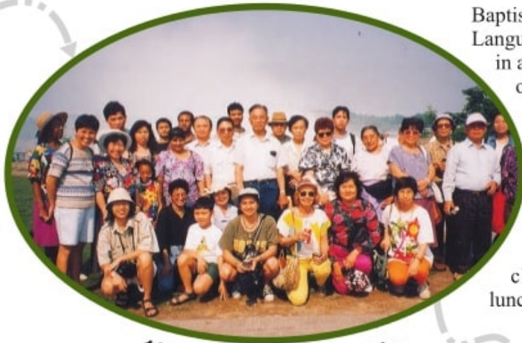
1996 - Niagara Falls Trip

Baptist Church to launch an English as a Second Language (ESL) program, which served newcomers in a Chinese community in Scarborough. Students of the ESL program were grateful for being able to gain independence in taking public transit, visiting the doctor's office, making appointments, and renewing their health cards mundane tasks fluent English speakers often don't give a second thought to. Besides developing their language skills, the students also participated in dance and praise classes, educational outings, evangelistic lunches, and special celebrations throughout