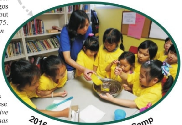
2016 - Children's Summer Camp