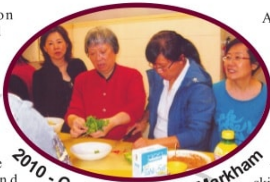
2010 - Cooking Class in Markham

classes, nutrition workshops, and dancercise classes. Similar to the Scarborough program, the Markham program also fostered a safe environment where immigrants and refugees could engage in their heritage culture while participating and integrating into Canadian culture.